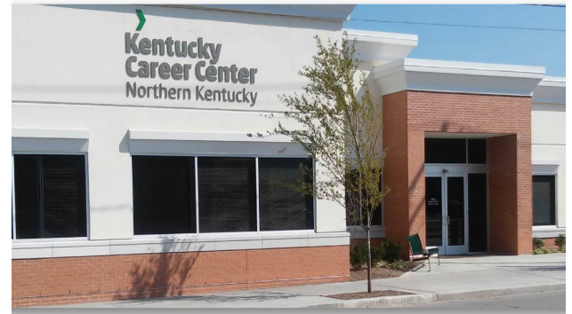
The Kentucky Career Center in Covington, at 1324 Madison Avenue, was featured during the Kentucky Statewide Youth Summit in September.