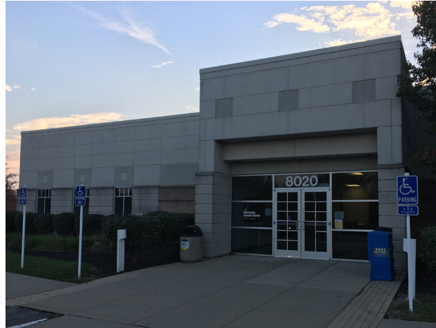
The Kentucky Career Center of Florence is located at 8020 Veterans Memorial Drive.