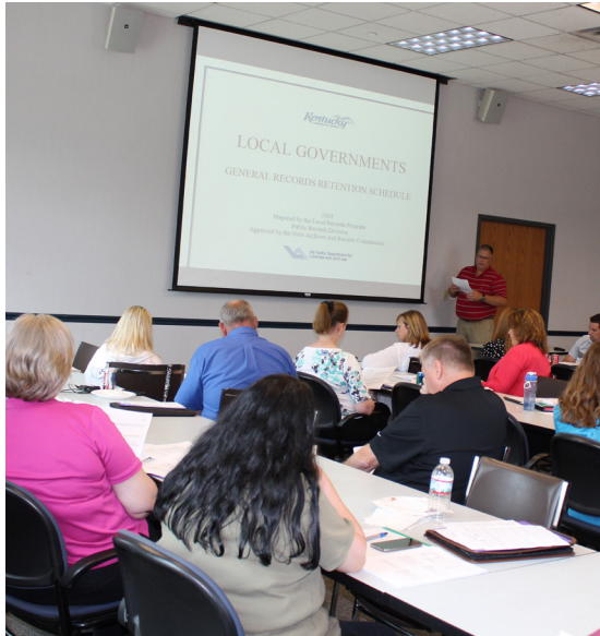
The Department of Local Governments hosted Open Meetings Training at NKADD in August.