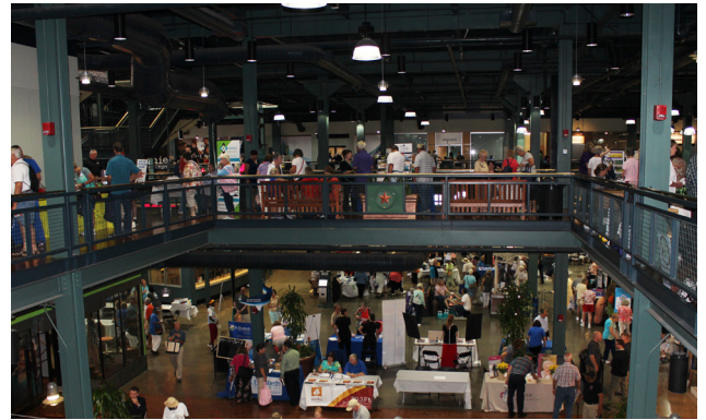
More than 1,000 people came to the Senior Expo at Newport on the Levee in August.

This program continues to provide supportive services for family caregivers in the region. Services include information and referral assistance, respite, outreach, and educational opportunities for individuals serving as primary family caregivers.