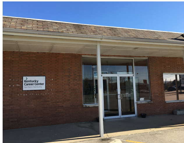
The Kentucky Career Center of Carrollton is at 1209 Highland Avenue, Suite E.