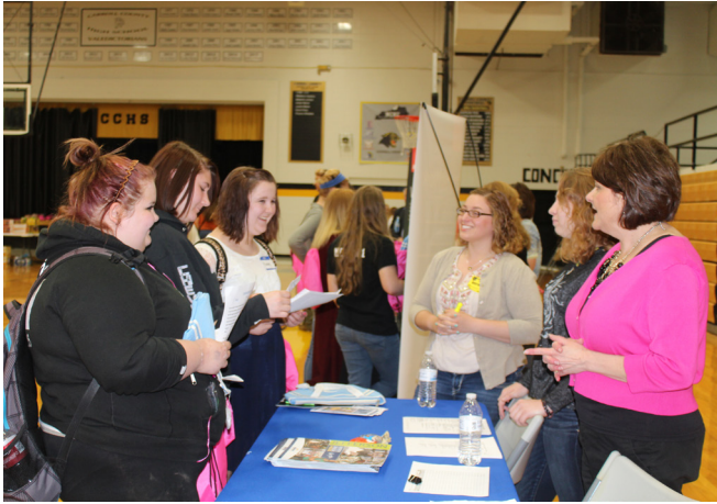
A variety of manufacturing companies share information about job opportunities during Girl's Day Out.

Girl's Day Out is an event intended to introduce high school girls to the many benefits of pursuing a career in the Advanced Manufacturing field. Eighty nine girls from Carroll, Gallatin, Henry, Owen and Trimble County schools were invited to participate in the event at Carroll County High School.